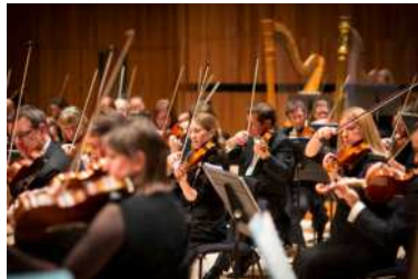
The Royal Philharmonic Orchestra

The 2024 King's Lynn Festival is brought to a magnificent close with The Royal Philharmonic Orchestra and a performance of Elgar's Cello Concerto and Dvořák's Eighth Symphony .